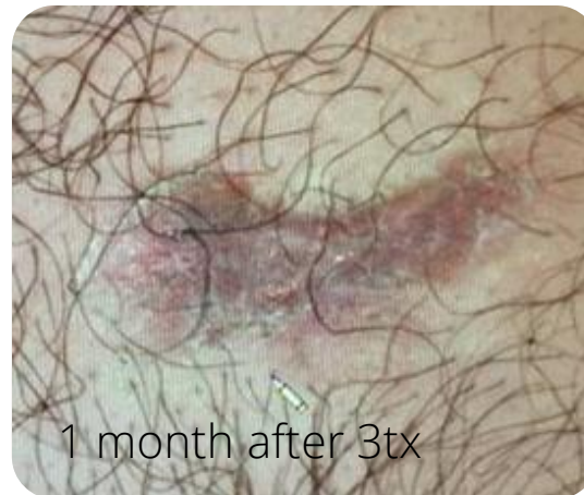
1 month after 3tx